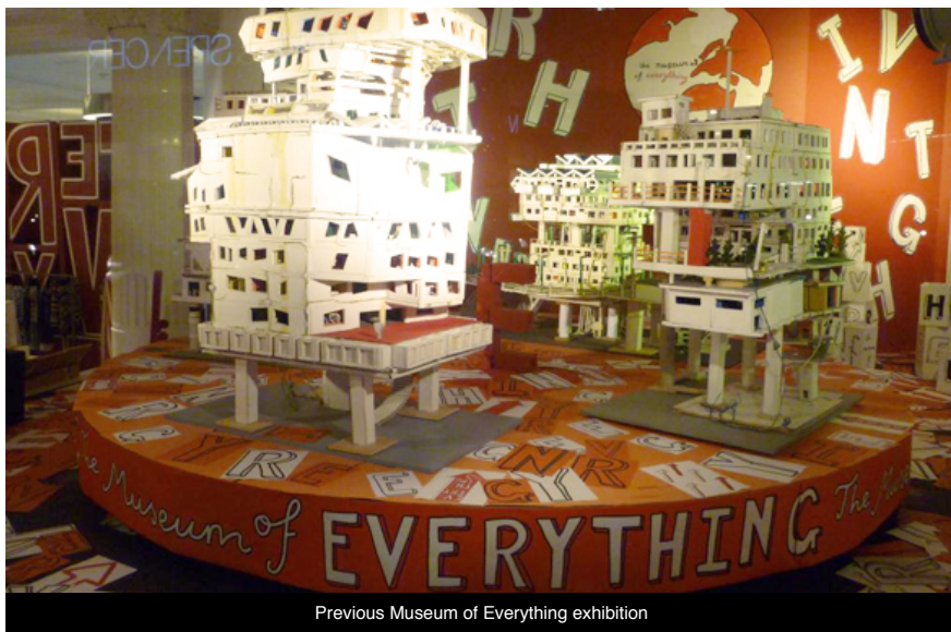
Previous Museum of Everything exhibition