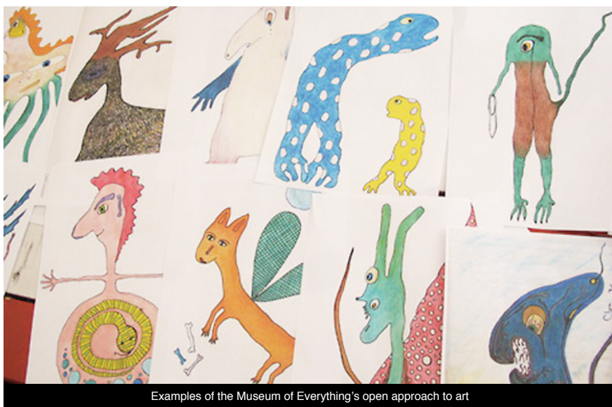
Examples of the Museum of Everything's open approach to art

Paris should be an interesting place for the MoE lot – it's considered by many to be the most elitist and closed art markets.