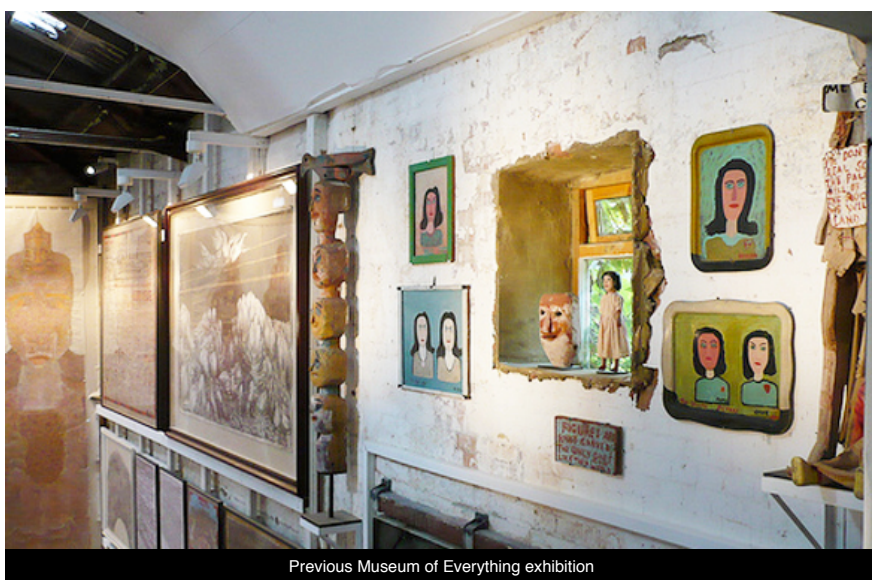
Previous Museum of Everything exhibition

The collection includes works by former slave and self-taught artist Bill Taylor (USA 1854-1949), Hawkins Bolden (USA 1914-2005), a blind and epileptic sculptor, and Judith Scott (1943-2005), who had Down Syndrome as well as being deaf and mute, yet created hundreds of small sculptures in her lifetime.